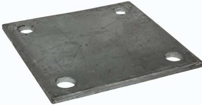
Base Plate (square)