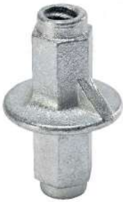
Water stopper 440 gr , 550 gr