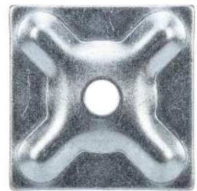
flat square washer 300 gr , 370 gr , 450 gr