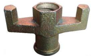
Wing nut 170 gr , 240 gr