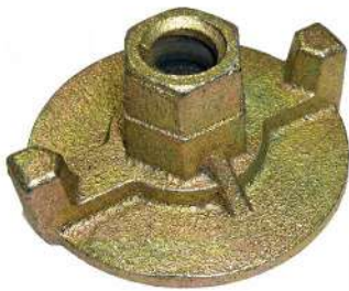
Wing washer nut Disc nut 350 gr , 450 gr , 550 gr